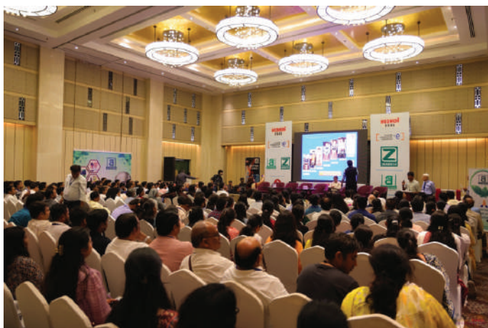
Scientific Session attended by 400 delegates

pregnancy. The sessions were on the following subjects – Homeopathic psychiatry, Homeopathic gynaecology, Homeopathic Research, Methodology, Case reports, Applied Homeopathy and Speciality homeopathy.