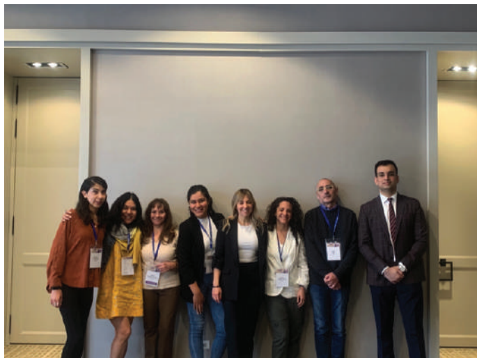
Newsletter Working Group members