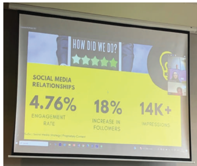
Social Media presentation

website ( www.LMHI.org ) for a wealth of documents detailing various activities, webinars, and more, accessible with your credentials.